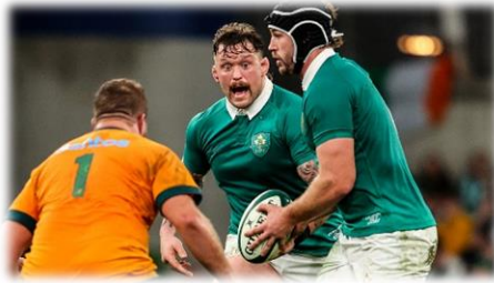
Australia v Ireland | Sydney 4 th July

We have put together a fantastic tour for you for the inaugural 2026 Competition which sees Ireland play Australia and Japan in Australia and then onto New Zealand to play the All Blacks who will no doubt be looking for revenge after the Ireland Series Win there in 2022. We had a wonderful tour then and I am sure it will be the same. The competition then continues in November when we play Argentina, Fiji and South Africa. The Finals take place at the end of November in London so will be an exciting end to the year.