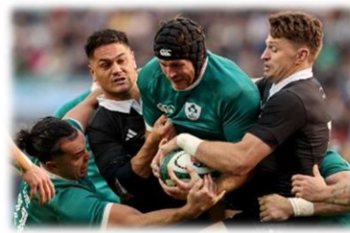
All Blacks v Ireland | Auckland 18 th July