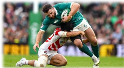
Japan v Ireland | Newcastle 11 th July