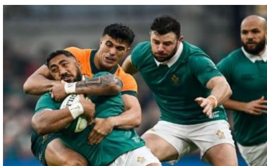
Australia v Ireland Sydney 4 th July

We have put together a fantastic tour for you for the inaugural 2026 Competition which sees Ireland play Australia and Japan in Australia and then onto New Zealand to play the All Blacks who will no doubt be looking for revenge after the Ireland Series Win there in 2022. We had a wonderful tour then and I am sure it will be the same. The competition then continues in November when we play Argentina, Fiji and South Africa. The Finals take place at the end of November in London so will be an exciting end to the year. (please note some match location locations are TBC so this package subject to change)