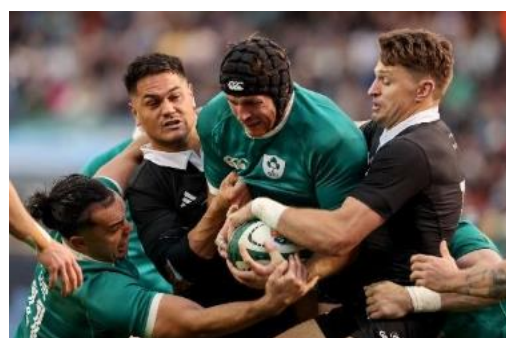
All Blacks v Ireland Auckland 18 th July